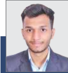
Rashtratej Aher Flipkart Wholesale